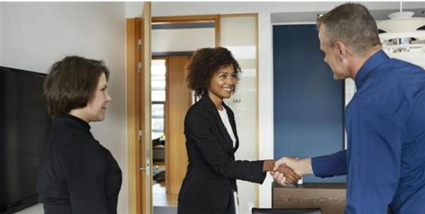
Small text caption below the handshake image.

Top materials: top 7 interview thank you lettersamples, top 8 resumes samples, free ebook: 75 interview questions and answer