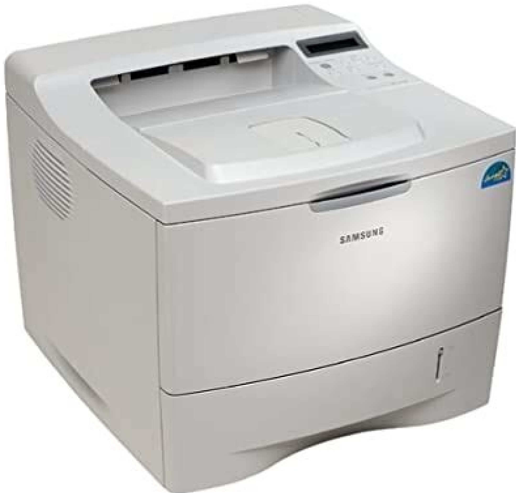
Samsung ml-2165w setup. Samsung ml-2165w driver downloads. Samsung ml-2165w manual. Samsung ml-2165w software download. Samsung 2165w manual.