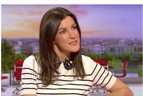
Bbc news presenters on today. Who are the female bbc news presenters. Past bbc female news presenters. Bbc breakfast news presenters female list.