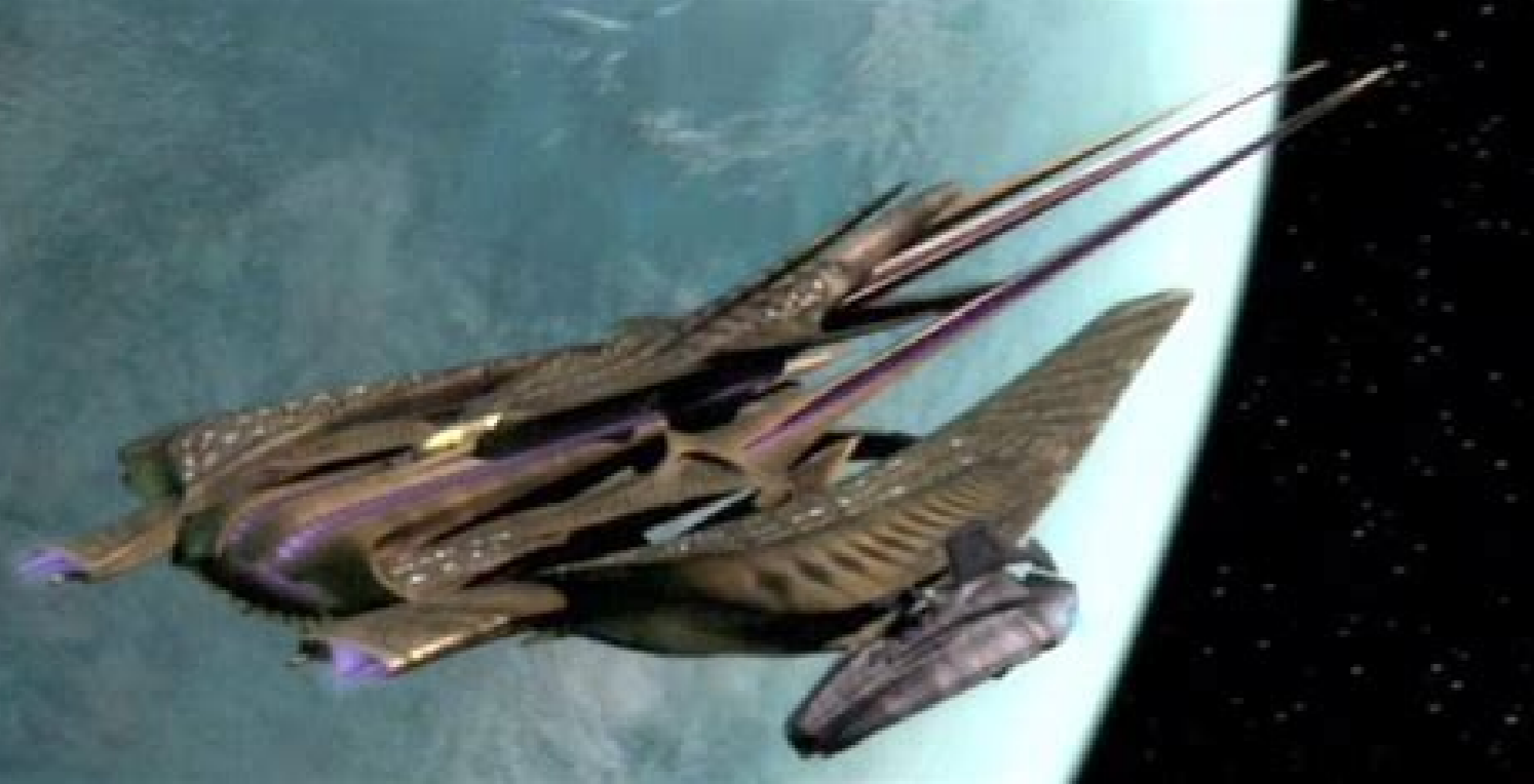
Dameron guide wikipedia.

BARS Bricks Club 579 W. 2nd S., 328-0255 (MW,D,F,C) 5pm-2am, chd Sun-Mon Deer Hunter 636 S. 300 W., 363-1802 (M,D,L,F,C) 4pm-1am, 10pm-2pm Wed