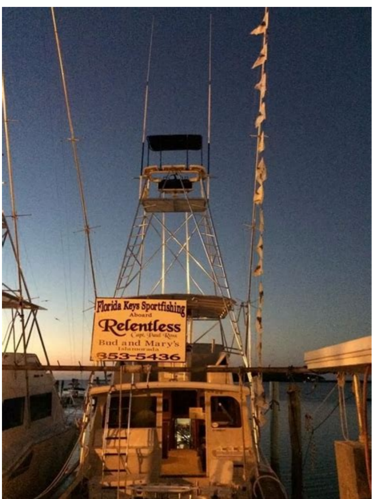
Fly fishing guides islamorada fl. Islamorada fishing guides and charters islamorada fl. Fishing guides islamorada fl.