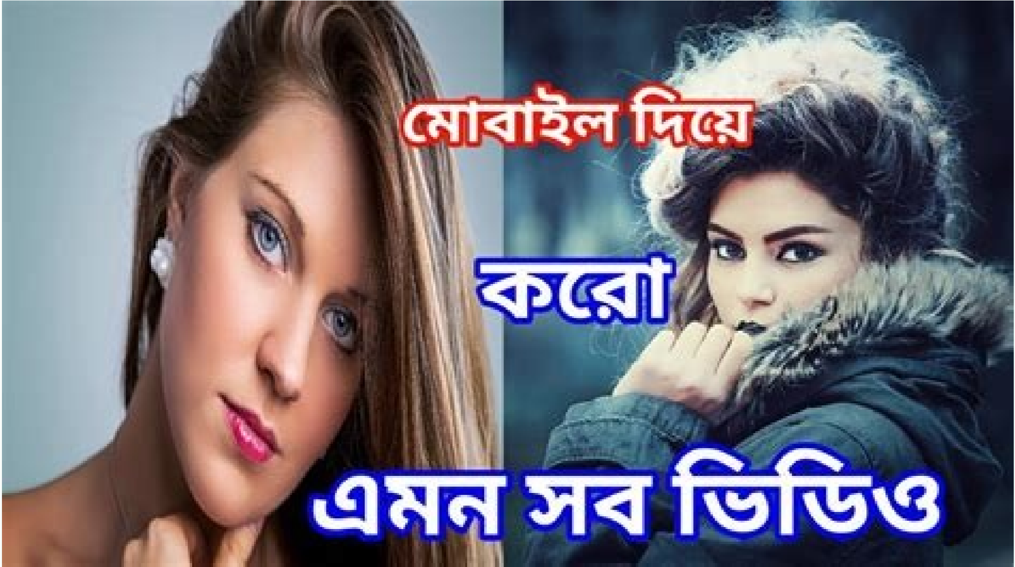
What is the best video recorder for android. The best hd video recording app for android. What's the best recording app for android. Which is the best video recording app.