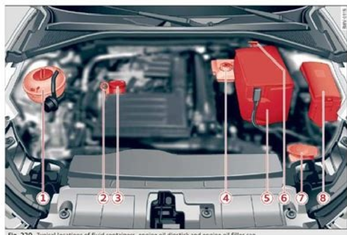
Fig. 220 Typical locations of fluid containers, engine oil dipstick and engine oil filler cap

Main components for checking and refilling