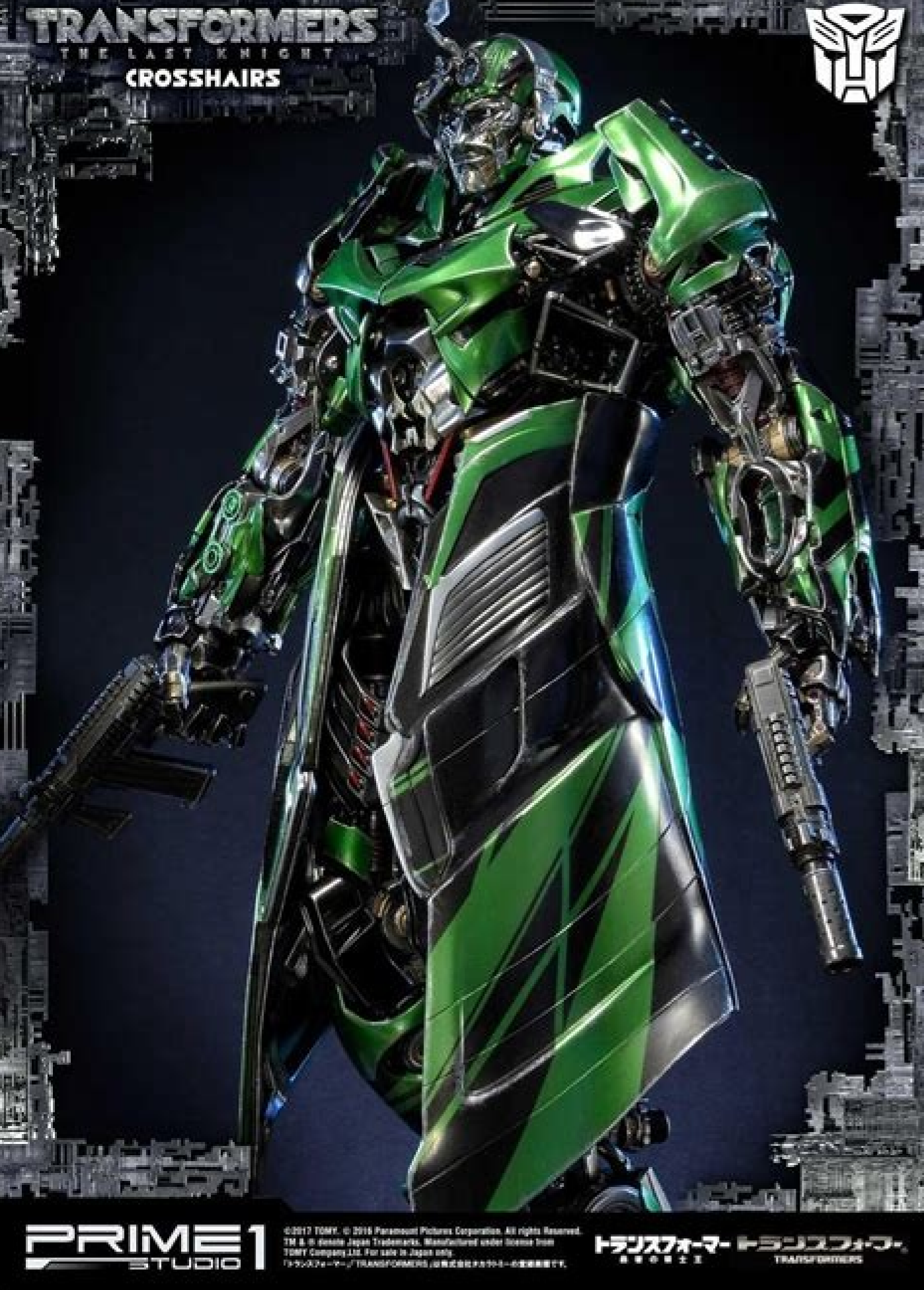
Autobots in the movie 1986. Name of autobots in transformers 1. Who were the original primes in transformers. Is optimus prime a transformer. What autobots died in transformers 1. Is the submarine in transformers a transformer. Who are the 7 primes in transformers. Why did optimus prime change in transformers 4.